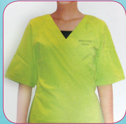
Kimono Item #681430 (Medium)