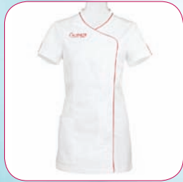
Lab Coat Small Item #681063