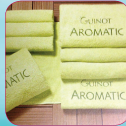
Aromatic Bed Sheet Item #681450