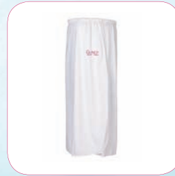
Plush Spa Wrap Item#681378