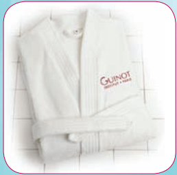
Bathrobe Item #681236

During the month of September when you spend $80 or more on Guinot uniforms, towels and accessories, you will get $20 to use towards back bar products.*