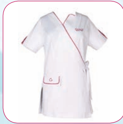
Lab Coat Medium - Item #681072 Lab Coat Large - Item #681078