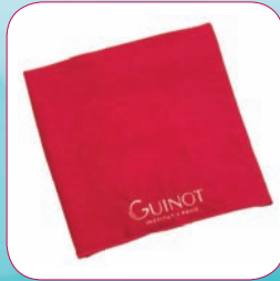
Red Facial Bed Cover Item #688490