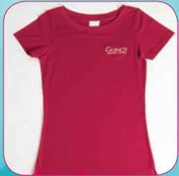
T-shirt Item #681510 (Medium) Item #681520 (Large) Item #681530 (X-Large)